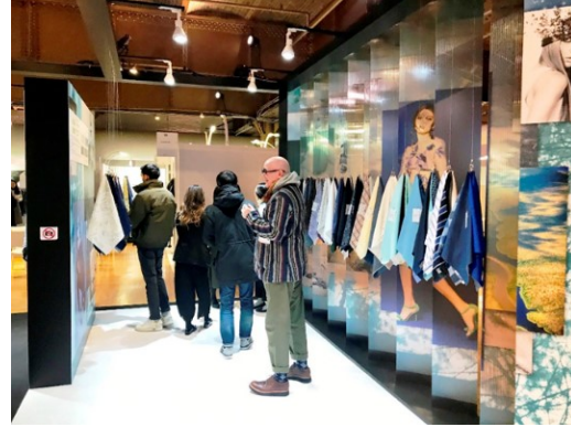
Exhibition booth of Japan Textile Salon 2019.

Last year, the salon hosted 21 textile exhibitors, who demonstrated new techniques and the use of fabrications and materials including high-quality silk, swiss cotton and indigo pile jacquard. These companies displayed unique dyeing and weaving techniques and specialty items such as selvedge denim woven on old-fashioned power looms and a high-grade silk threading process, along with premium fabrics made with spun silk using advanced technology.